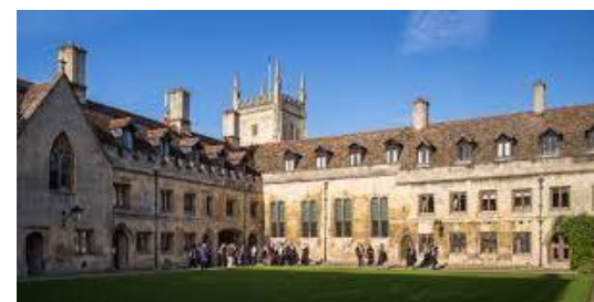
Pembroke College, Oxford. Location for our BTRU—GEMS Annual Meeting

10-11 September BTRU-GEMS Annual Meeting, Pembroke College, Oxford (invitation only)